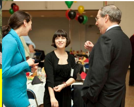
Green Unity Gala